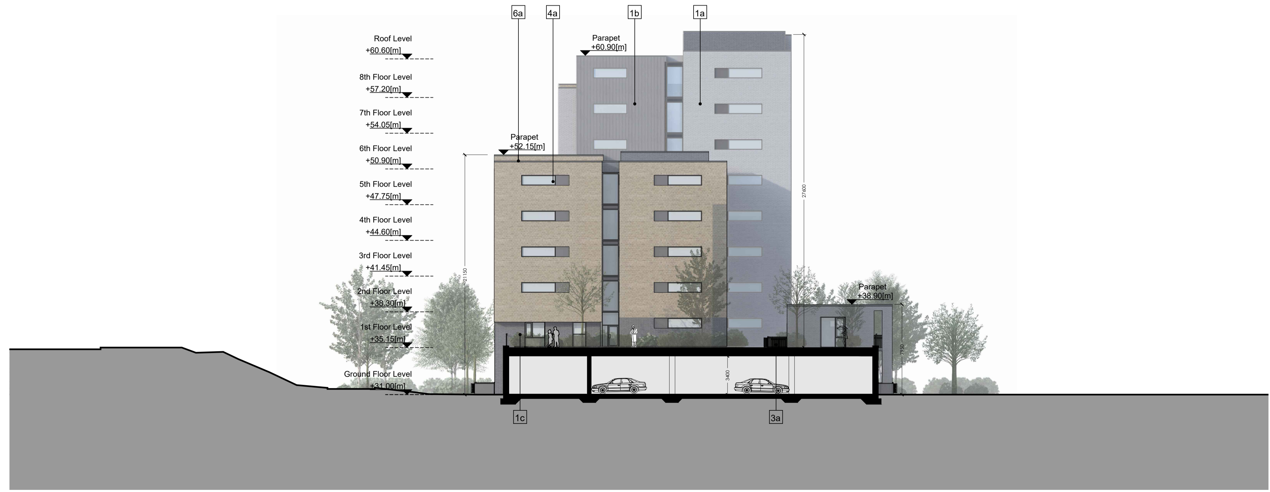
East Courtyard Elevation - Block 6 Scale 1:200 @A1